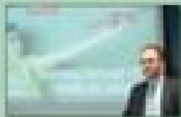
Local YECs and Business Leaders

Each video is a 100-minute video featuring a local YEC and a local business leader. The videos are available in 10 languages: English, Spanish, French, German, Italian, Japanese, Korean, Russian, Chinese, and Hindi.