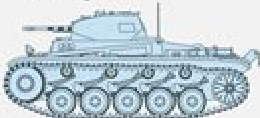
Pz. I Ausf. A