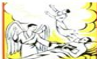
The Glorious Homecoming of the Believer