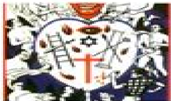
The Tempted and Divided Heart