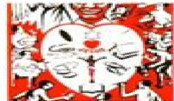
The Victorious Heart