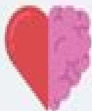
Emotional & Mental Health