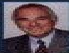
BURTON GOLDBERG — THE EDITOR — ALTERNATIVE MEDICINE DIGEST