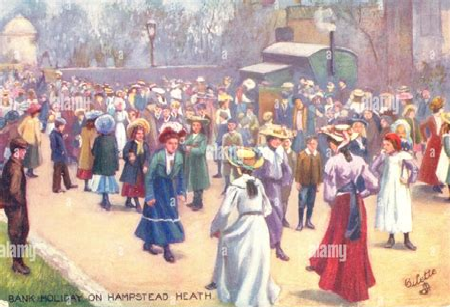
BANK HOLIDAY ON HAMPSTEAD HEATH