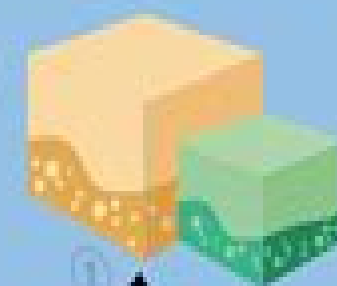
Conceptual Redox (Training images)