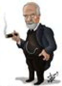
PERS 5 Freud's View of the Human Mind: The Mental Iceberg