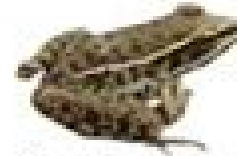
Southern Leopard Frog