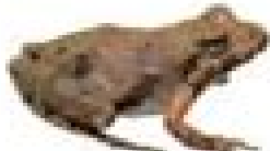
Eastern Cricket Frog