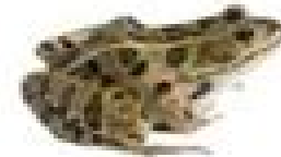
Northern Leopard Frog