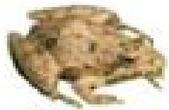
Northern Cricket Frog