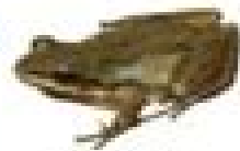
Boreal Chorus Frog