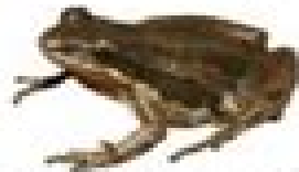
Western Chorus Frog