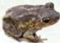
Eastern Spadefoot Toad