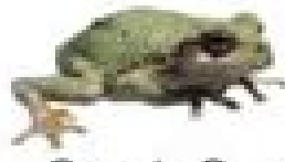
Cope's Gray Treefrog