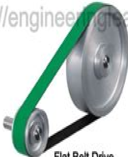
Flat Belt Drive