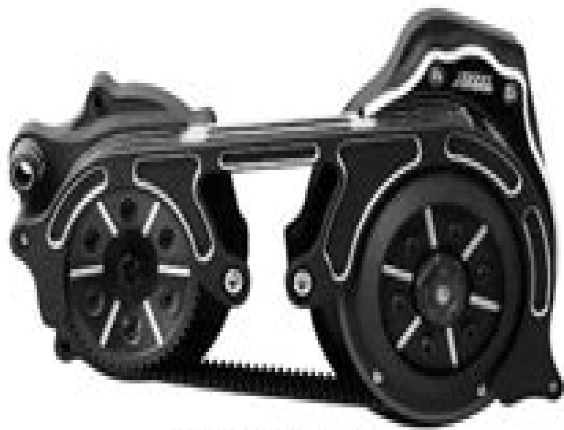
Open Belt Drive