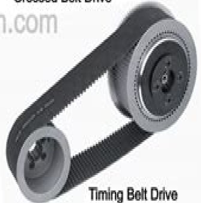
Timing Belt Drive