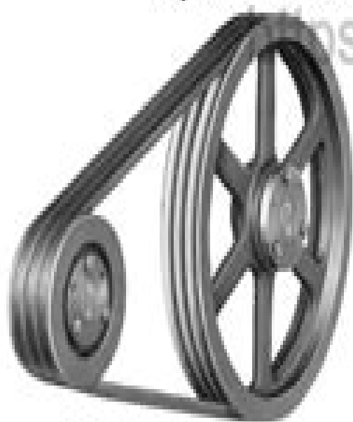
V Belt Drive