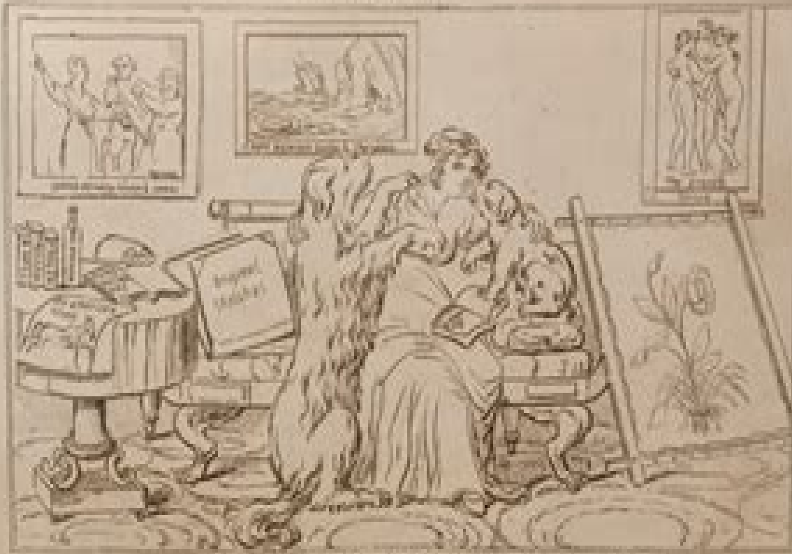
This engraving is a beautiful illustration of the power of reading and writing. It shows a woman sitting on a chair, reading a book. A large dog is sitting on the floor next to her, looking up at her. To the left is a table with a lamp and books. On the wall are three framed pictures. To the right is a plant in a pot.