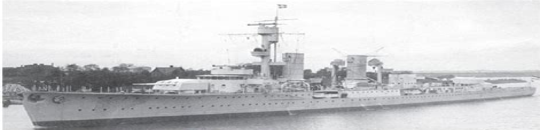
Karlruhe on 15 October 1929, passing through the Kiel Canal to Wilhelmshaven for completion work and commissioning. The shipyard flag flies at the foretop; the mercantile flag hoisted at the ensign staff indicates that the cruiser is not yet in service.