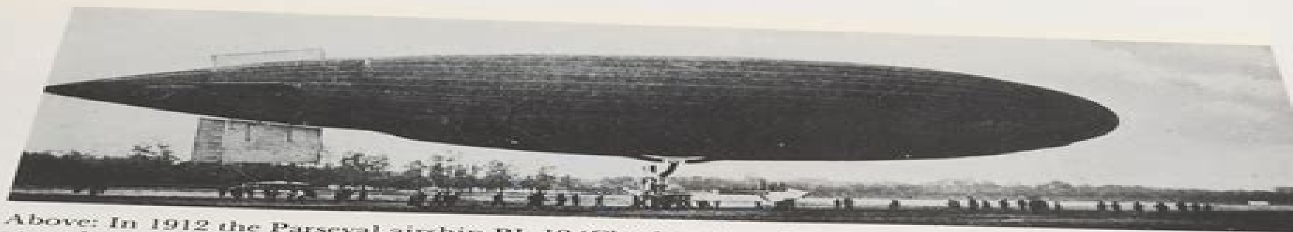
Above: In 1912 the Parseval airship PL 12 'Charlotte' was built; it is shown here at an intermediate stop in Wanne-Herten.