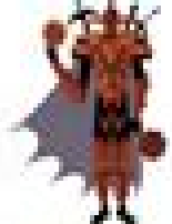
ARES / MARS GOD OF WAR