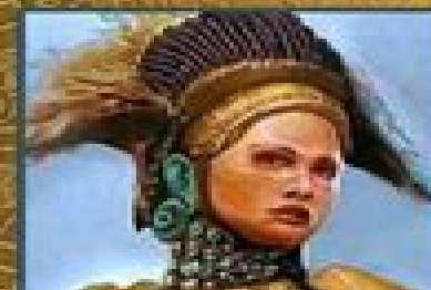
CHICOMECOATL Goddess of Maze