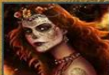
CHANTICO Fire Goddess