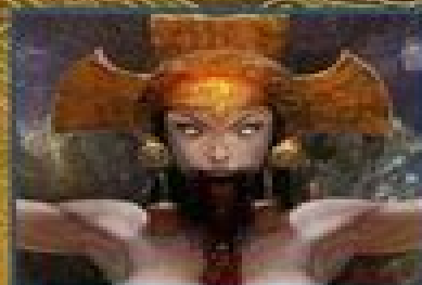
MICTECACIHUATL Underworld Goddess