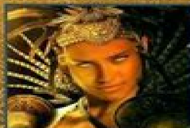
TLAZOLTEOTL Goddess of Purification