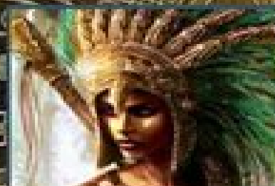
TONANTZIN Mother Goddess