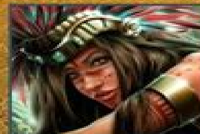
MAYAHUEL Fertility Goddess