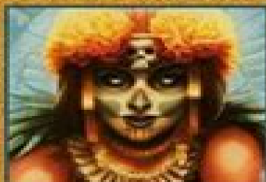
TALTECUHTLI Goddess of Chaos