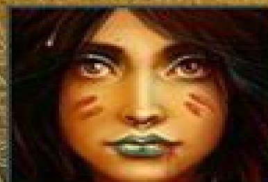
XOCHIQUETZAL Goddess of Pleasure