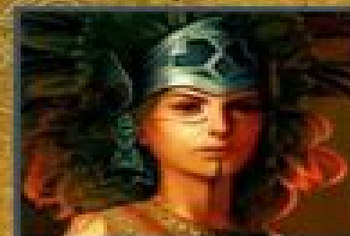
COYOLXAUHQUI Moon Goddess