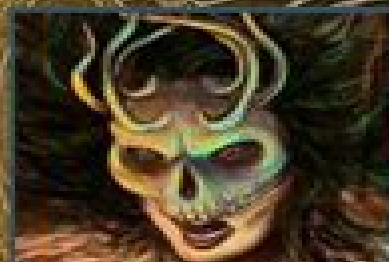
ITZPAPALOTL Warrior Goddess