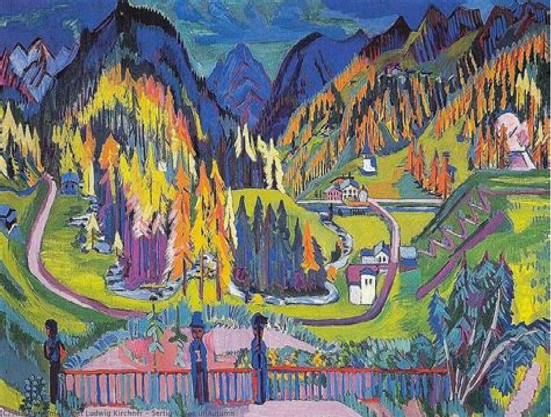
L. Kirchner - Sertig Valley in Autumn