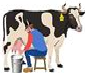
Milk (Cow, Buffalo)