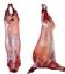
Meat (Hen, Goat)