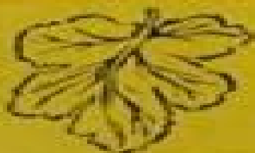
LADY CHATTERLEY'S LOVER