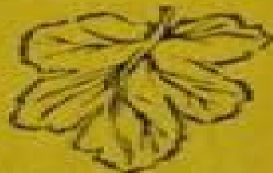
TROPIC OF CANCER