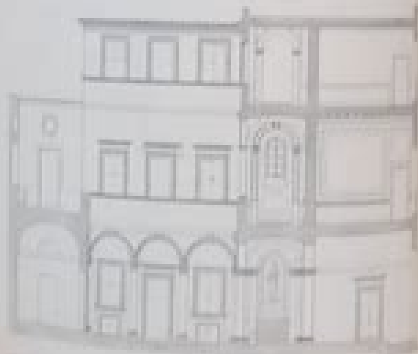
Fig. 2. Building facade.