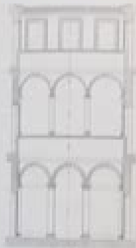
Fig. 1. Tower section.