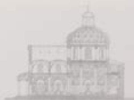
Fig. 3. Building facade.