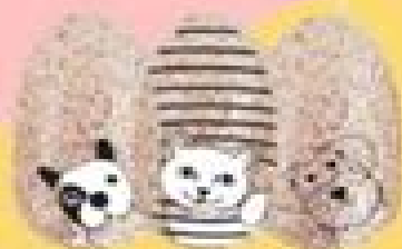
Chelsea Ya Later