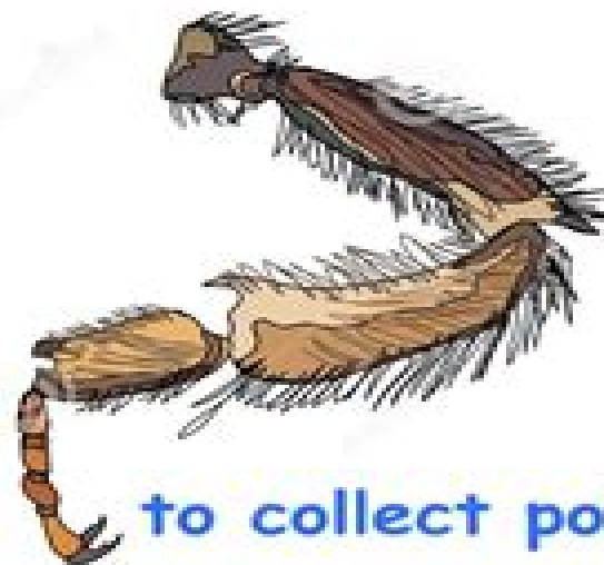
to collect pollen