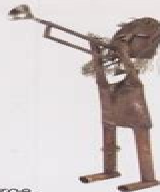
Text and photo portraits by Gary Monroe