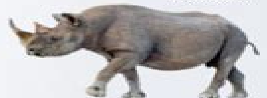
West African Black Rhinoceros