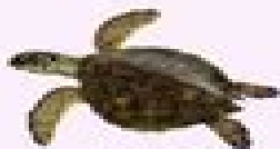
Hawksbill Sea Turtle