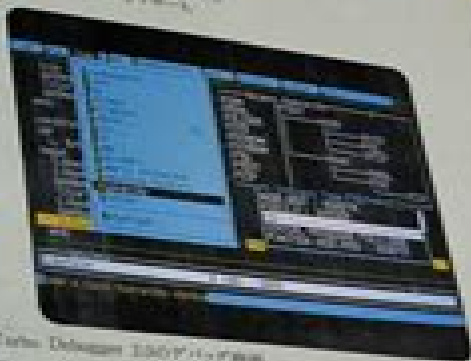
● Turbo Debugger 2.00デベロッパー画面。

■ Turbo Profiler: 実行時の全範囲プロファイラ。 Turbo Profilerは、プログラムのパフォーマンスを向上させるための、実行時の全範囲 環境を備えたプロファイラです。プログラムの性能を解析するために、32ビットのデータ 型で記録され、24ビットの範囲プロファイラを提供するに役立ちます。 ● 関数や行の実行時間/実行回数を測定。 ● 関数の呼び出し履歴を記録し、呼び出し順序を調査。 ● フォールバックモードにカーネル時間を利用。 ● デモモードプロファイラサポート。