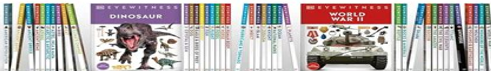
图 10-1-10 图例

Packed with pictures and full of facts, DK Eyewitness books are perfect for school projects and home learning.