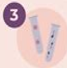
3 Egg and Sperm Preparation