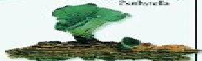
Green Stain Cap