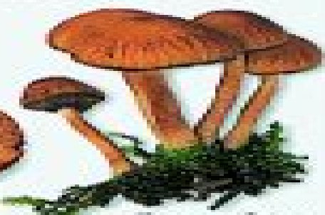
Greenish Stumpy Puffball