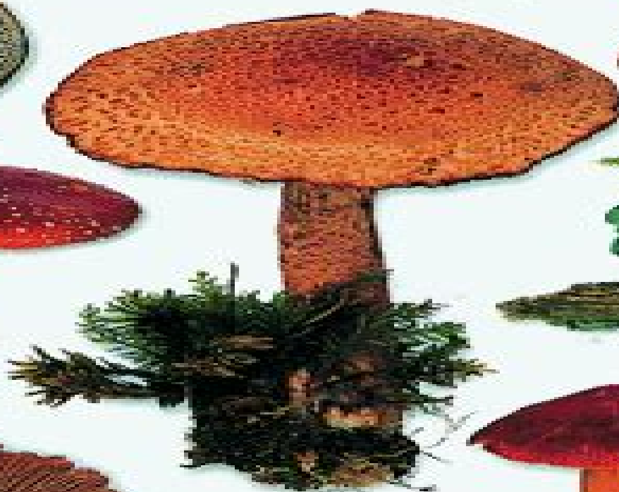
Marbled Porcini Cap