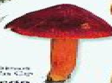
Crimson Wax Cap