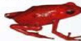
Splendid Poison Frog