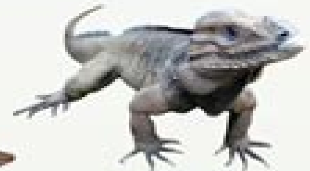
Navassa Rhinoceros Iguana