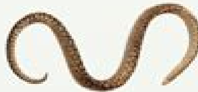
Round Island Burrowing Boa