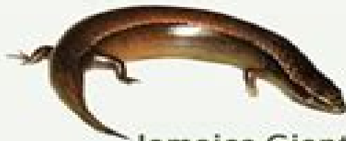
Jamaica Giant Galliwasps