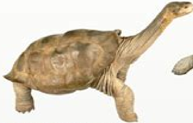
Pinta Giant Tortoise