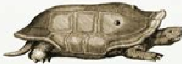
Réunion Giant Tortoise