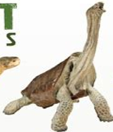
Saddle-backed Rodrigues Giant Tortoise