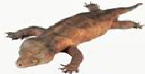
Delcourt's Giant Gecko