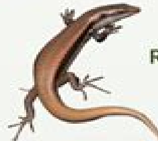
Cape Verde Giant Skink