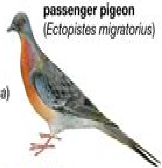
passenger pigeon ( Ectopistes migratorius )