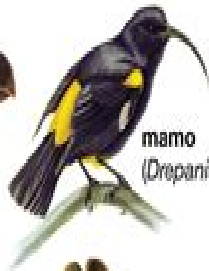
mamo ( Drepanis pacifica )