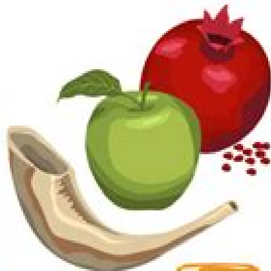
ROSH HASHANA ראש השנה