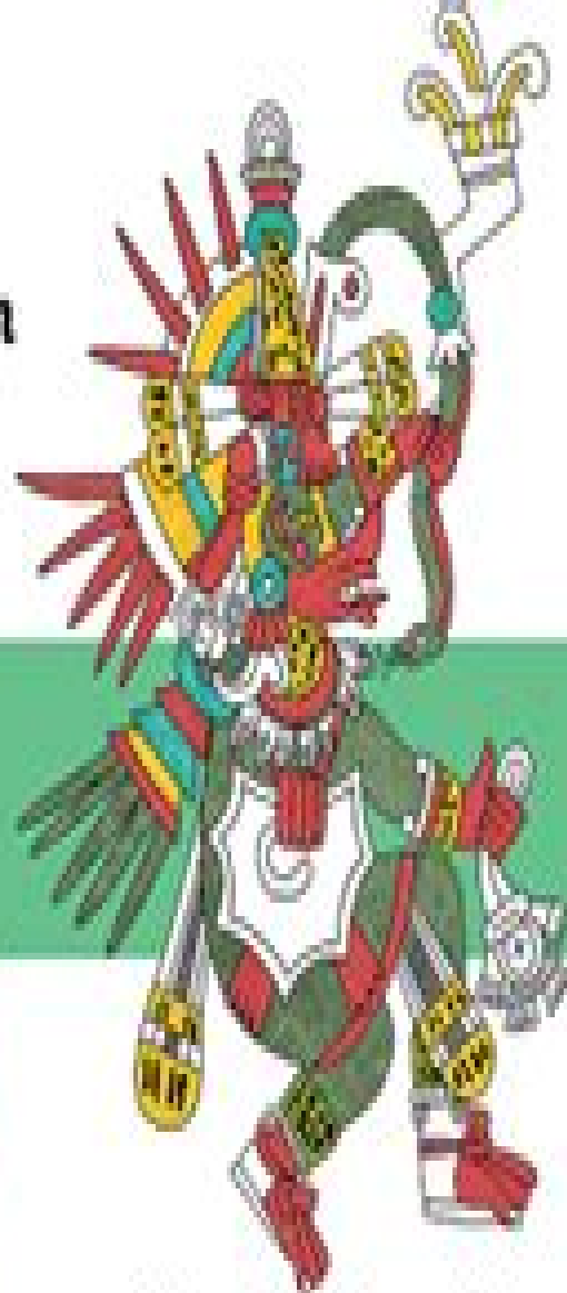
Quetzalcoatl God of Civilisation and Order