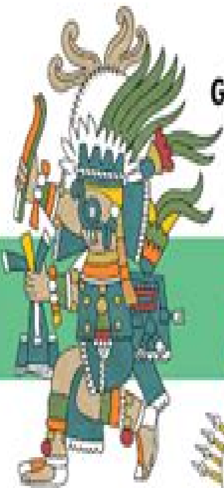
Tlaloc God of Rain