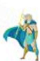
ZEUS / JUPITER GOD OF THE SKY