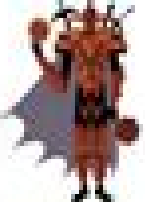
ARES / MARS GOD OF WAR