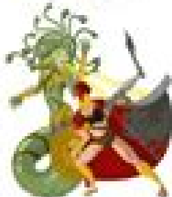
PERSEUS AND MEDUSA