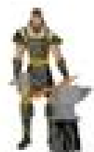
HEPHAESTUS / VULCAN GOD OF THE BLACKSMITH