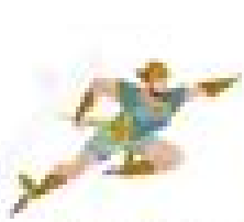
HERMES / MERCURY GOD OF COMMERCE