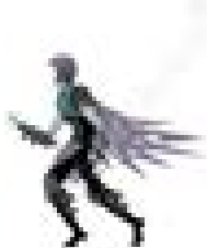
HADES / PLUTO GOD OF DEATH