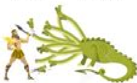
HERCULES AND THE HYDRA