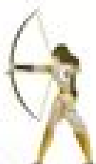
ARTEMIS / DIANA GODDESS OF THE HUNT