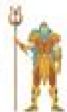
POSEIDON / NEPTUNE GOD OF THE SEA