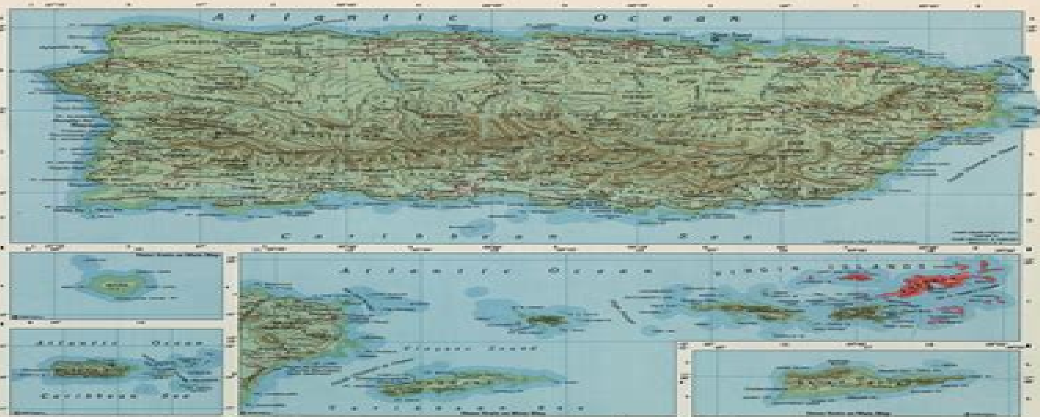
PHYSICAL MAP OF PUERTO RICO