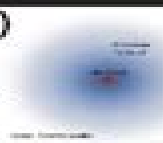
COTTON BALL OR MODERN ATOM MODEL