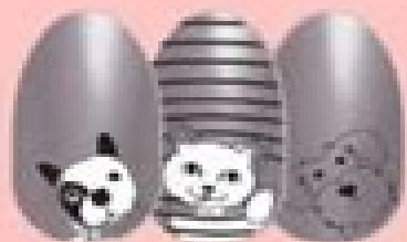
Berlin It To Win It