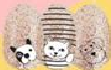
Chelsea Ya Later