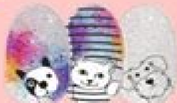
Paint The Town