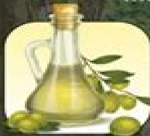
Olives & Olive Oil

The Bible identifies many foods that are beneficial to good health and longevity. This is important because your diet can have a profound impact on your physical, mental, emotional and spiritual well being.