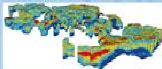
Boreholes (Geology and geochemistry)