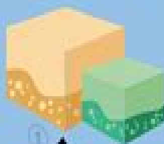
Conceptual Redox (Training images)