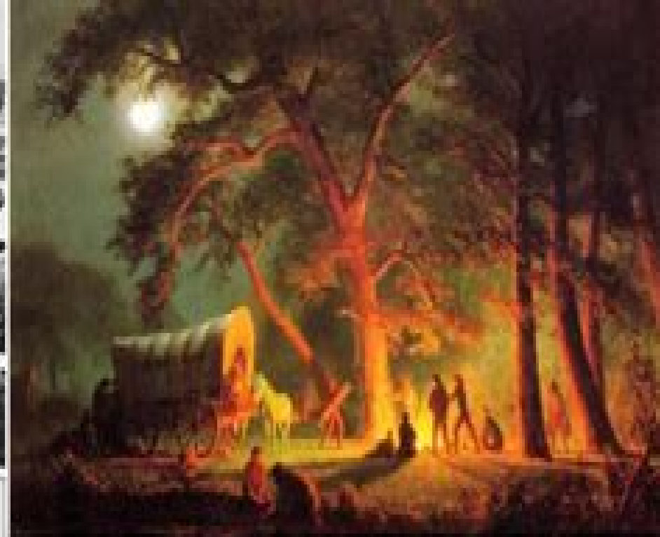
Oklahoma and Indian Territories