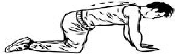
Cat and Camel