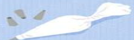
Piping Bag & Tips