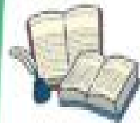
English Language Arts