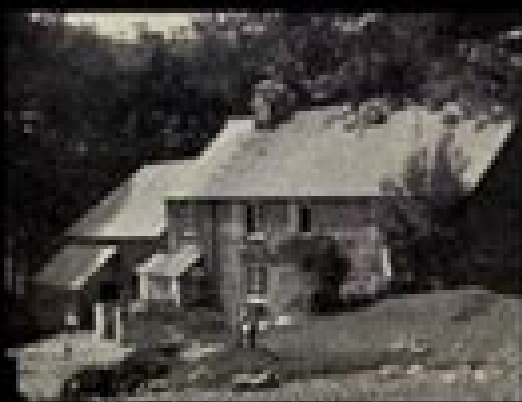
RUDDYFORD FROM THE WHIRLWIND