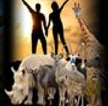
Land animals, Adam and Eve