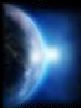
Earth covered by water, light