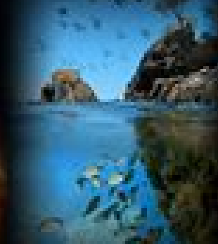
Birds, and sea creatures