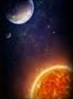
Sun, moon, and stars