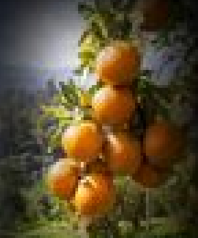
Dry land, plants and fruit trees