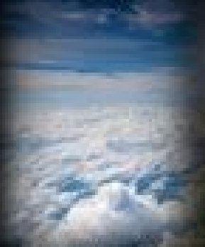
Atmosphere and sky