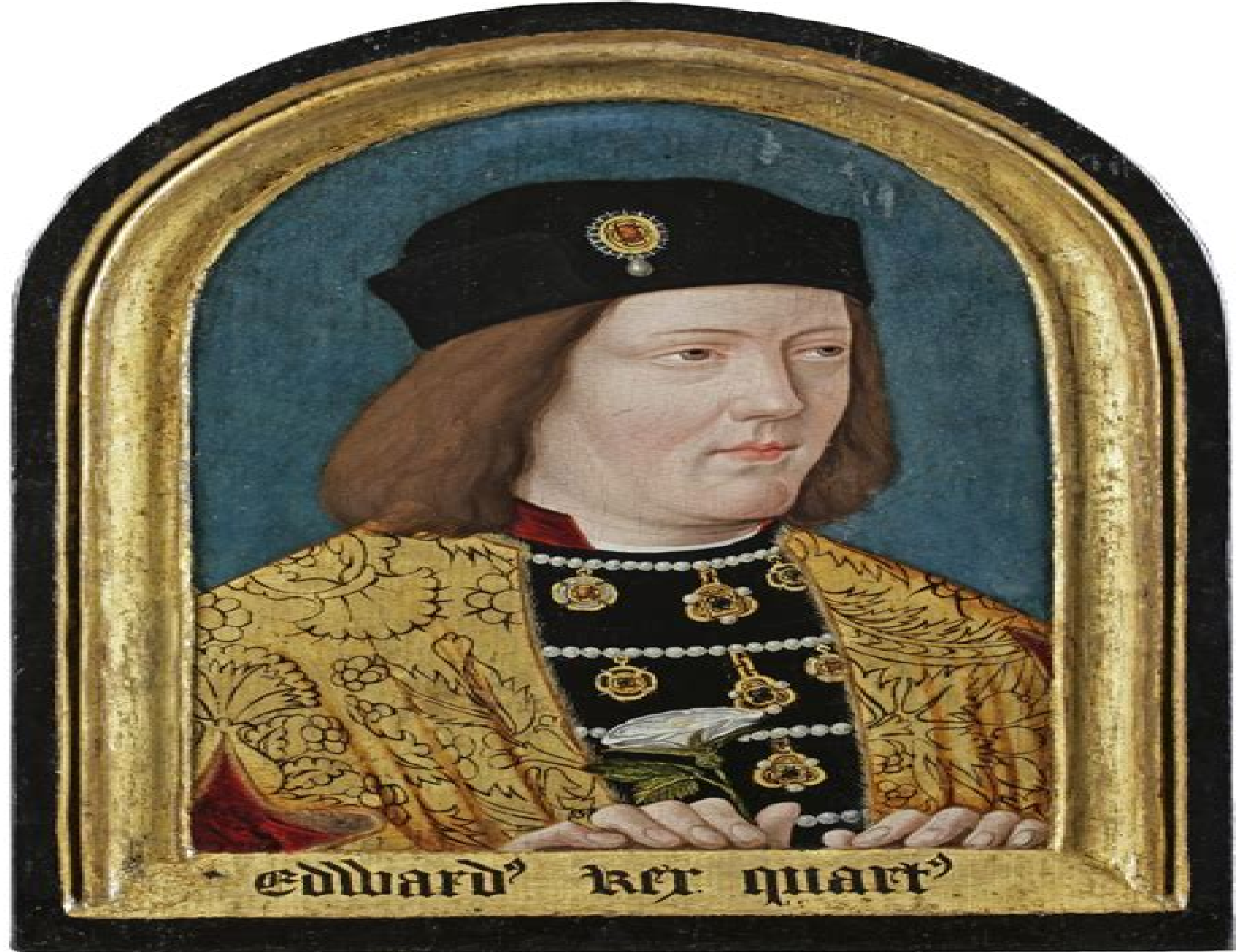
edward 4 rex quart us