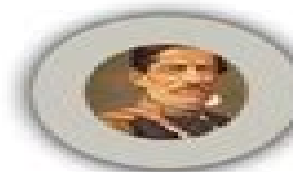
JOSÉ BALTA 1868-1872