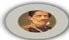
JUAN PEZET 1863-1865