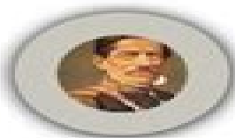
RAMÓN CASTILLA 1845-1851/1855-1862