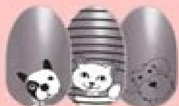
Berlin It To Win It