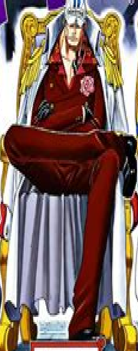
Marine HQ Admiral Azama (Sakuragi)