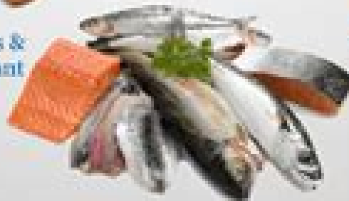
Fish such as Salmon, high in Omega-3